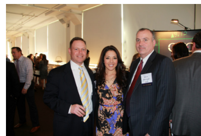
Security Traders Association of New York (Part 1)

77th Annual Dinner and Conference April 25, 2013 Three Sixty New York, NY